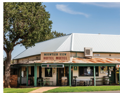
MOUNTAIN VIEW ENJOY A HOME-COOKED MEAL AND ICE-COLD DRINKS IN THE FRIENDLY MOUNTAIN VIEW HOTEL.