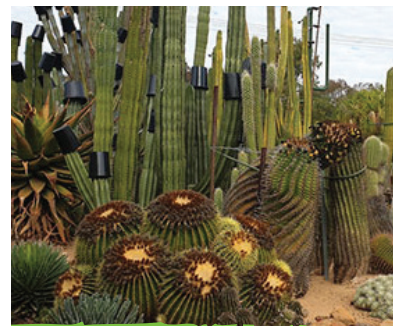
CACTUS WORLD ONE OF AUSTRALIA'S LARGEST PRIVATE COLLECTIONS OF CACTI.

Just across the road from the park you'll find the friendly Mountain View Hotel. Enjoy a home-cooked meal and ice-cold drinks.