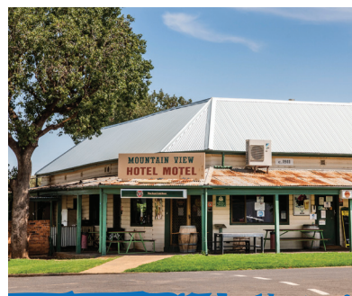
MOUNTAIN VIEW ENJOY A HOME-COOKED MEAL AND ICE-COLD DRINKS IN THE FRIENDLY MOUNTAIN VIEW HOTEL.