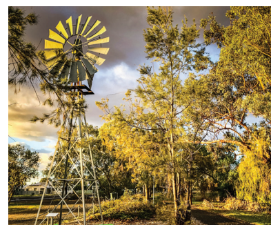
THE WINDMILL WALK A BEAUTIFUL 2KM (ONE WAY) WALK BESIDE THE CASTLEREAGH RIVER.

Then, discover life throughout history, with interactive displays and plenty of machinery to inspect at the Gilgandra Museum. See an original Howard Rotary Hoe, which was invented right here in Gilgandra! You can also see our place in the World's Largest Solar System Drive - we're Neptune!