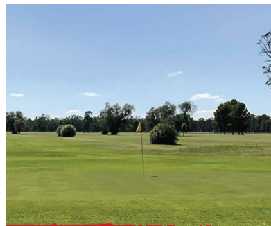
GOLF COURSE IF YOU HAVE TIME, SNEAK IN A ROUND OF GOLF.

You will find a public barbecue located at Hunter Park if you wanted BYO dinner or duck across the road to the Kingsway Chinese Restaurant for an easy but delicious dinner option!