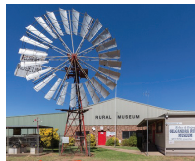
MUSEUMS GILGANDRA MUSEUM AND COO-EE HERITAGE CENTRE.